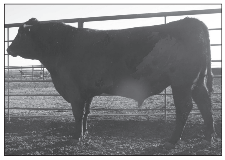
Lot 16: BRR Marathon Supreme 1306

Another moderate BW (2.1) bull and grandson of Woodhill foresight from TMAR also. A wellframed, rugged bull ready to go. Semen tested, no creep. Negative for BVD-PI.