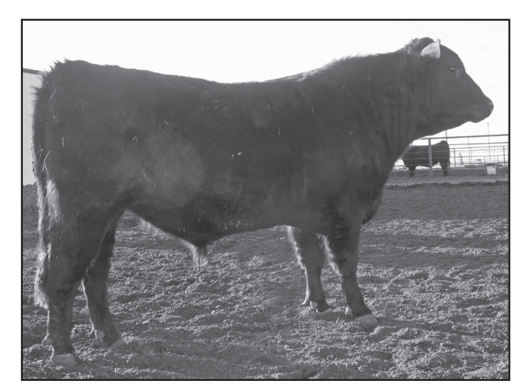
Lot 14: BRR Density Saugahat 1302

A moderate birthweight bull and a grandson of Woodhill Foresight that is deep bodied and well muscled with an overall eye appeal. He has the potential to add pounds with his YW EPD of +68. Semen tested, no creep. Negative for BVP-PI.