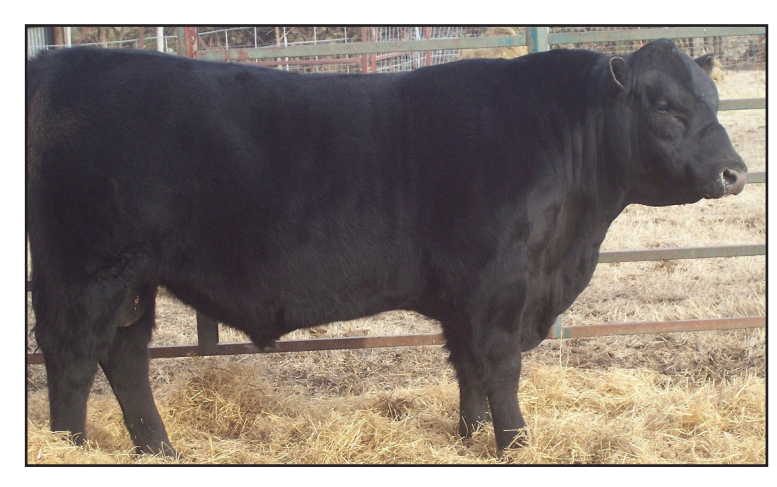
Lot 41 Hunts Eagle Eye 4034