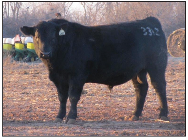
Lot 2: TM Thunder 3312