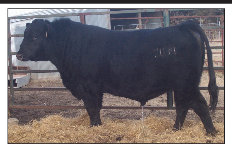
Lot 1: Hunts 0597 Traveler 2034