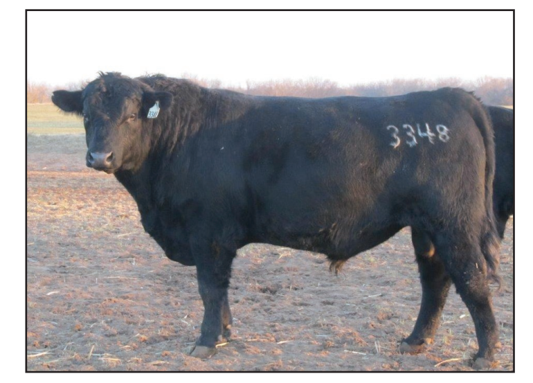
Lot 9: TM Prime Star 3348